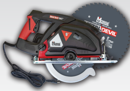
PART# CSM9NXTB (100977) 9" METAL CUTTING CIRCULAR SAW 9" METAL DEVIL® NXT Steel cutting blade included