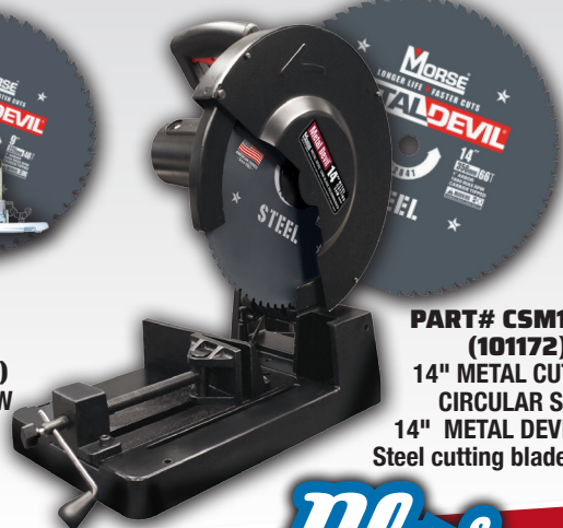
PART# CSM14MB (101172) 14" METAL CUTTING CIRCULAR SAW 14" METAL DEVIL® NXT Steel cutting blade included