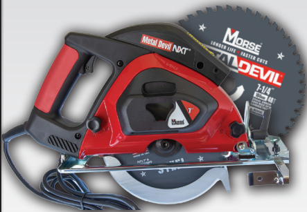
PART# CSM7NXTB (100960) 7" METAL CUTTING CIRCULAR SAW 7" METAL DEVIL® NXT Steel cutting blade included

Purchase a 7", 9" or 14" METAL DEVIL® SAW Get an Additional Blade FREE